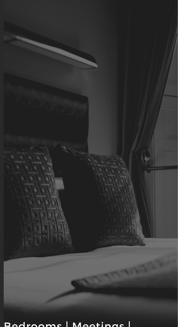
Bedrooms | Meetings | Breakfast Meetings and more...